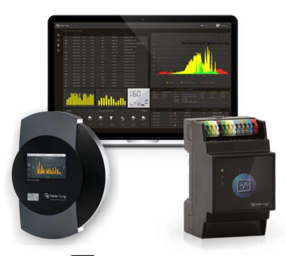
Made in Germany